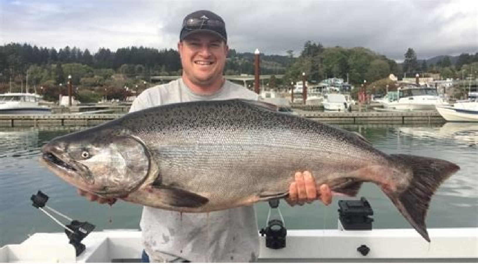
Best rivers for salmon fishing in Oregon. Where is the best salmon fishing in Oregon. Best salmon fishing Oregon coast.